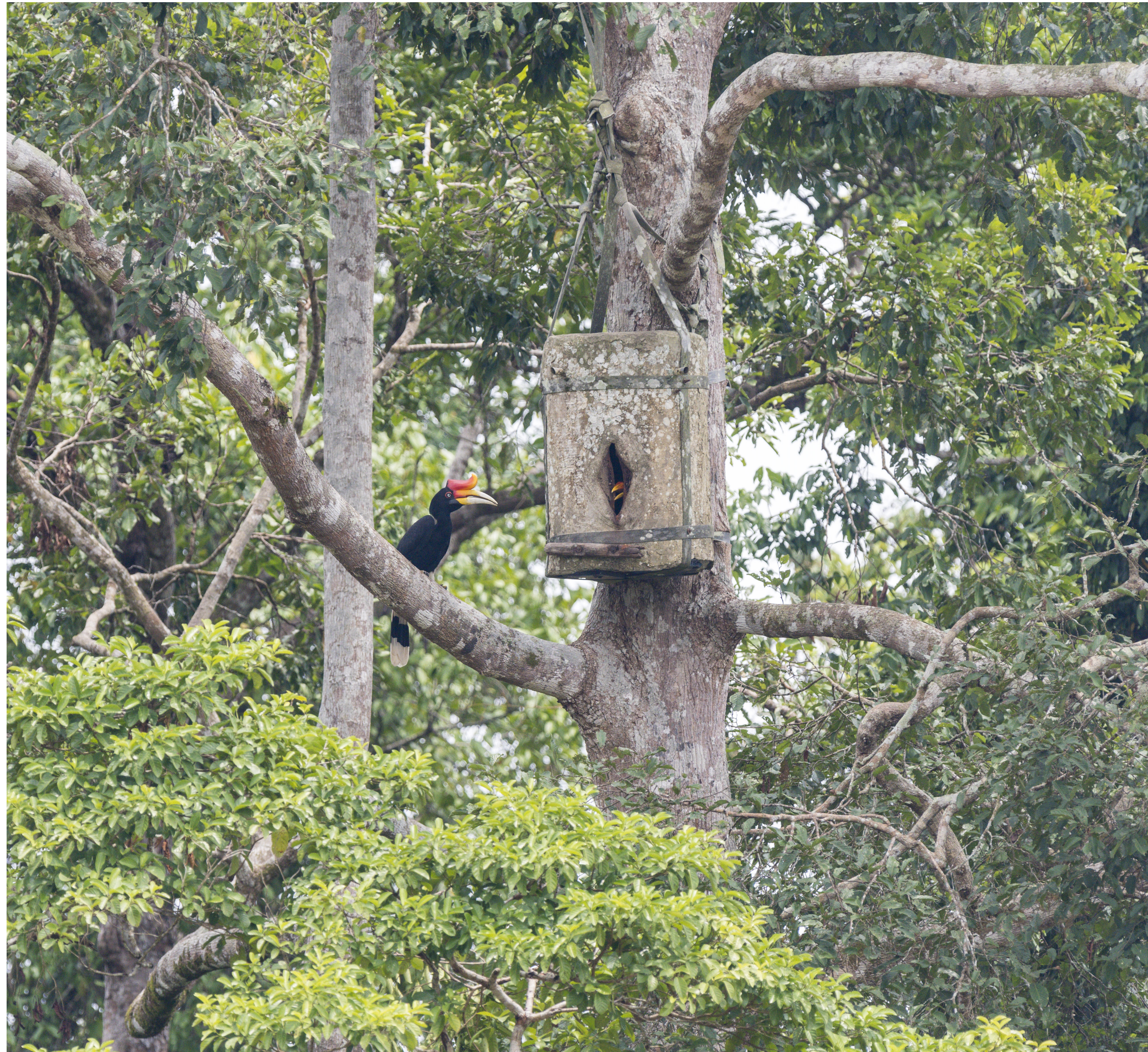
Rhinoceros hornbill ( Buceros rhinoceros )

The team also recorded nesting Oriental pied hornbil and Bushy-crested hornbill in these boxes.